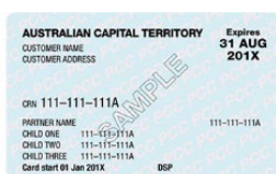
Pensioner Concession Card (Bulk Billed Weekdays/ Concession Gap Weekends)

Do you have a concession card? Please let reception know if so to ensure you are billed correctly.